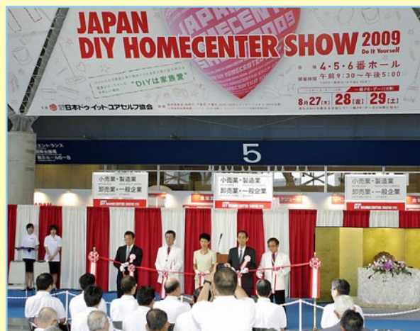
*Photo is JAPAN DIY HOMECENTER SHOW 2009